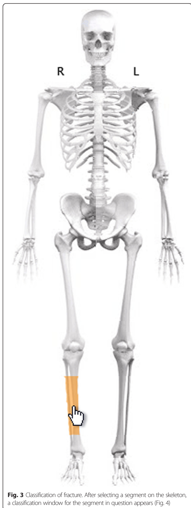
Fig. 3 Classification of fracture. After selecting a segment on the skeleton, a classification window for the segment in question appears (Fig. 4)

step, with the AO/OTA code (instability pattern) generated in the next step. Similarly, proximal radius and ulna fractures are classified for each bone separately, ultimately linking them together. Acetabular fractures are classified in accordance with both AO/OTA and Letournel [17]. Hip fractures are classified in accordance with AO/OTA, but the descriptions associated with the diagrams refer to the Garden classification of cervical hip fractures [18]. In the same way, proximal humerus fractures are assigned an AO/OTA class, but the description parallels Neer's terminology [19]. Clavicle fractures are classified in accordance with Robinson and scapula fractures are classified in accordance with Euler and Rüedi and Ideberg, whereas foot fractures are assigned a modified OTA code [20–22].